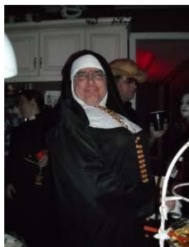
This lady is worth upwards of $880! Are you feeling lucky?